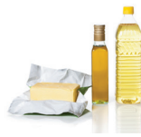
Fats and Oil