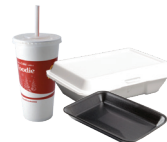
Plastic (and bioplastic) to go containers