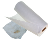
Napkins and Paper Towels