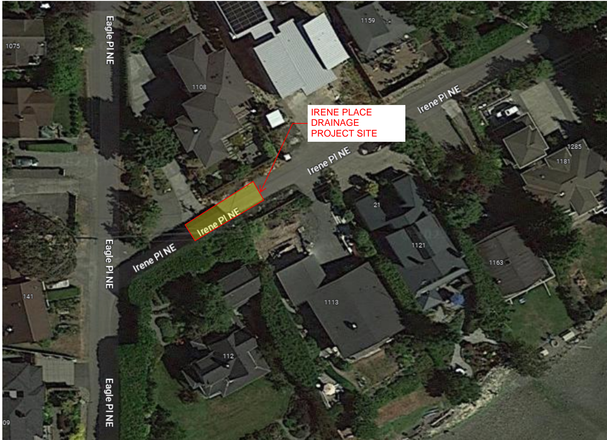
ANNUAL DRAINAGE - IRENE PLACE NE